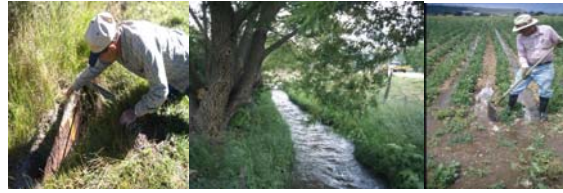
Acequia Vallejos Parshall Flume

Fort Garland Museum Mess Hall 9 a.m.— 4 p.m. Fort Garland, CO